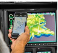
FlightStream 510 Compatibility

With a reduced takeoff field length, the HondaJet APMG gives fliers greater access to airport locations