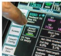
Advanced Integrated Takeoff and Landing (TOLD)