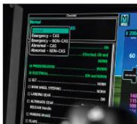
Enhanced Electronic Checklist